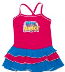
TUTU FRILL DRESS

All Ready Set Dance, students will be required to wear the official uniform that we are sure you will love. Below are the following options that can be purchased at reception.