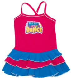
TUTU FRILL DRESS

All Ready Set Dance, students will be required to wear the official uniform that we are sure you will love. Below are the following options that can be purchased at reception.